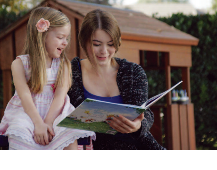
"Life beyond my biggest dreams."