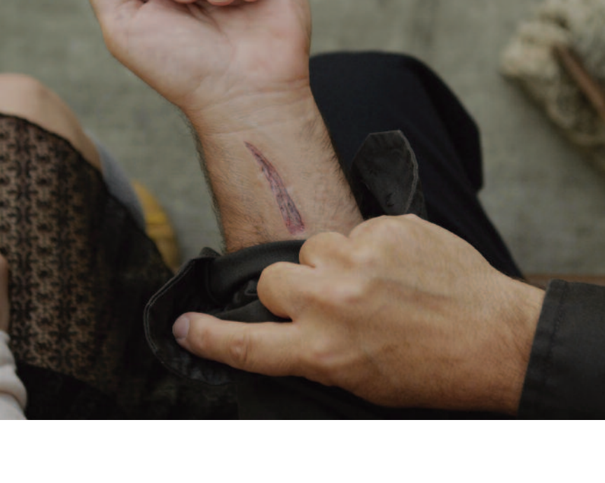
John 3:16 — For God so loved the world...