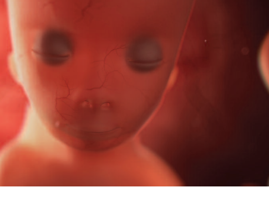
"Even now she has a tiny heart, smaller than a speck."