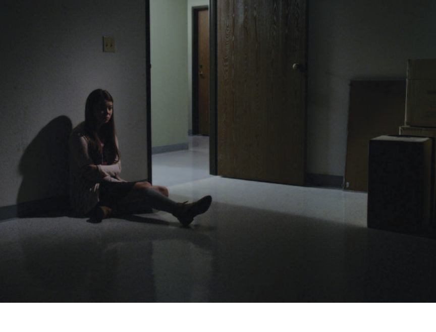
"I just don't know what to do..."