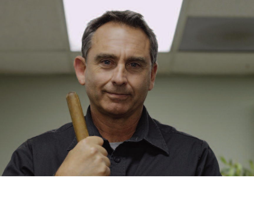
"You have a future beyond your biggest dreams."