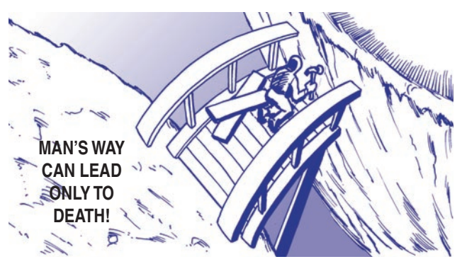
"There is a way that seems right to a man, but in the end it leads to death." PROVERBS 16:25 (SEE ROMANS 3:10-12)

Man tries to bridge the gap,but sinful man can never reach a Holy God by man-made bridges.