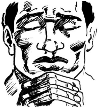
Lesson Four TALKING TO GOD AND JESUS

Talking to God, your Heavenly Father, is called "prayer." You will want to talk to God regularly as the Bible tells you in 1 Thessalonians 5:17, "Pray without ceasing." We can pray anytime and anywhere.