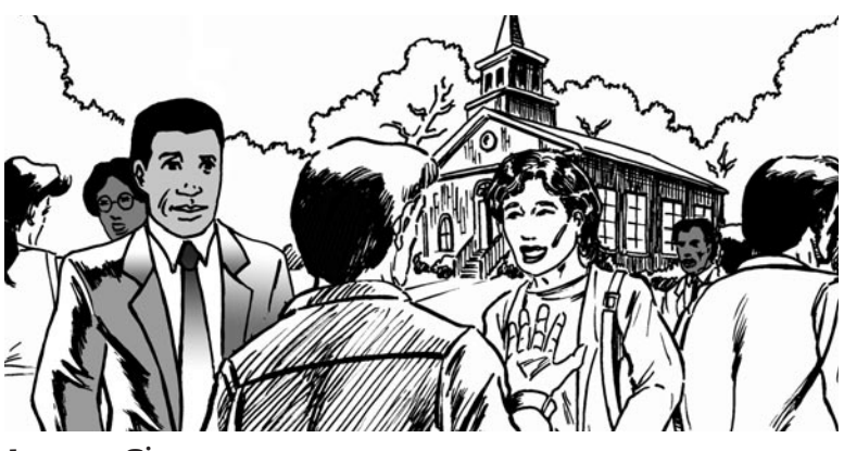
Lesson Six TELLING OTHERS ABOUT JESUS

Now that you are a child of God, you will want to tell other people about Jesus. You can be a witness—one who tells what God has done for them.